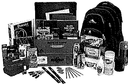
Note: Picture is a representation of a SchoolKidz school supply kit. Actual kit contents will vary. Backpack and other additional items are not included with the kit and are an optional purchase.

Kit Pick Up: Meet The Teacher Day - In Child's Classroom